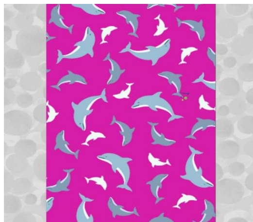
Block 2 diagram

All of the blocks are made up in the same way. For the block you need to sew a strip of fabric 11 to each side of a 4½" x 6½" to make the block.