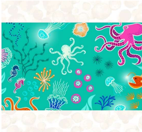
Block 1 diagram