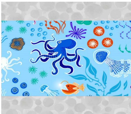
Block 1 diagram